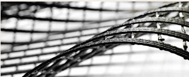
TenCate Miragrid® GX.

Both Miragrid® GX and Polyfelt® PEC are quick and easy to install and work effectively with various types of facing systems. Practical green-facing systems can also be easily adopted to blend in with the surrounding environment.