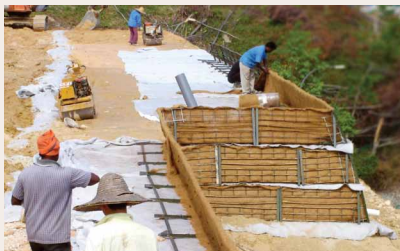
Steel mesh formwork being set-up above layers of Polyfelt® PEC geotextiles.

TenCate Polyfelt® PEC is most commonly used as the reinforcement when the soil mass consists of finer-grained backfill that has poor drainage properties. Alternatively, TenCate Miragrid® GX geogrid is typically used to reinforce coarser-grained soil backfills. This system is ideal for slopes with angles up to 80° and heights ranging from 2m to 25m. It provides a stable facing that blends with the surrounding landscape.