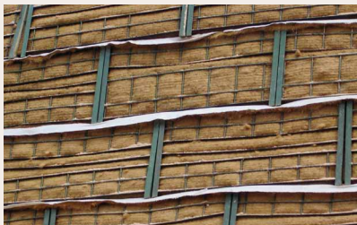
Front of a steep slope with steel mesh formwork facing nearing completion.