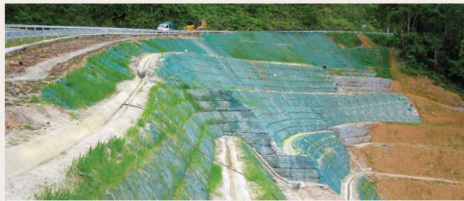
Establishing vegetation onto a completed reinforced slope.

This proven system is a preferred choice for designers and contractors alike because of the easy and rapid construction technique and, especially, its cost effectiveness.