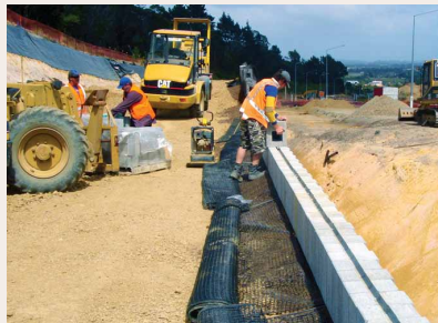
Reinforcing with Miragrid® GX geogrids.

Installation of the block wall facing, geosynthetics and the soil backfill are all in one construction process. Thus, the construction is relatively fast without the need for special lifting equipment and highly skilled labour. Reinforced segmental block walls have become an accepted practice for a fast, durable, aesthetic and cost effective retaining wall. The system is suitable for applications ranging from landscape terraces, housing developments to major structural walls.