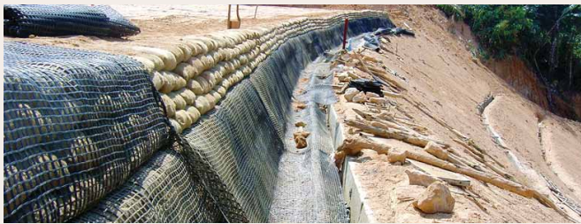
Miragrid® GX geogrids being wrapped around stacked geobags to construct a wall.

This facing system is suitable for slopes with angles up to 80° and heights varying from 3m to 50m. Ground water seepage is controlled by installing a geosynthetic wrapped stone drainage layer at the rear of the reinforced soil structure with the ground water discharged through drainage pipes into surface drains. The completed structure, when vegetated, blends easily with the surrounding environment. It is a proven and cost effective alternative to conventional concrete structures.