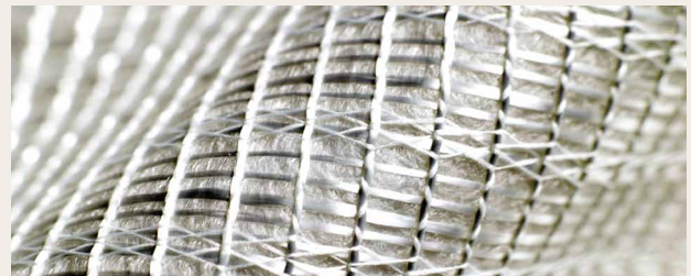
TenCate Polyfelt® PEC.