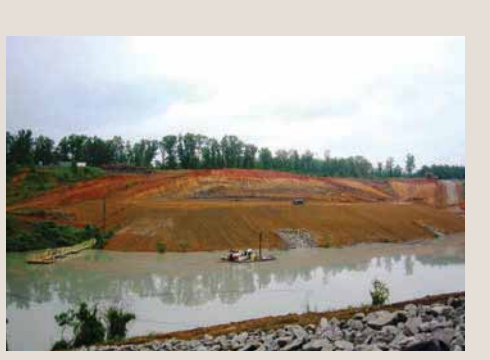
Reclaimed site after dewatering