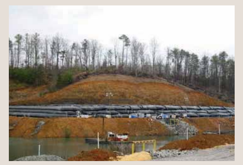
Dewatering of waste slurry

Whether it be a natural disaster, a catastrophic event affecting tailing ponds, permit restrictions, interruptions of mechanical dewatering processes, above or underground capacity limitations, or sudden increase in slurry production that strains the existing dewatering facility, TenCate Geotube<sup>®</sup> containers, in a variety of sizes to fit almost all situations, are readily available to restore tailings operations.