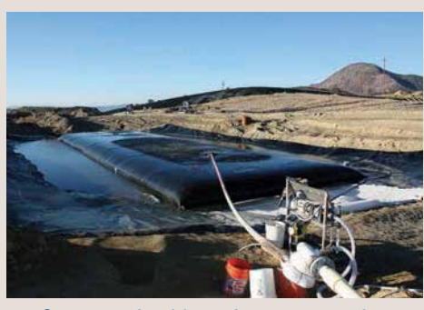
Capture of gold ore for reprocessing