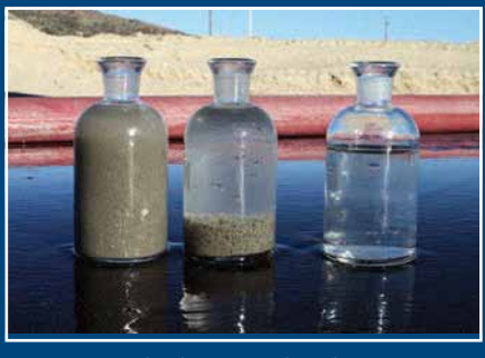
Sludge before (left) and after (right) treatment with Geotube® dewatering technology.

TenCate Geotube<sup>®</sup> containers can be custom-sized to fit available space and be easily removed when dewatering is complete. Dewatered solids can be safely stored on site, re-utilized to build dykes and berms, or disposed of in a landfill without expensive dredging or transportation.