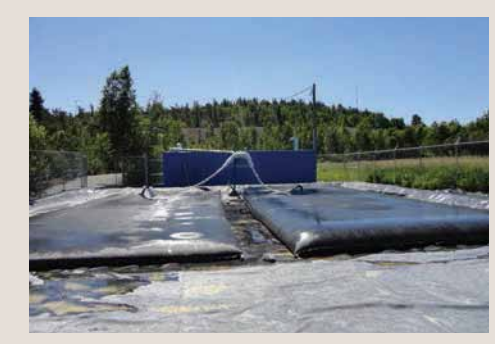
Closed loop process for drilling water management

The specially engineered TenCate Geotube<sup>®</sup> textile retains the solids while releasing the clear water through the pores of the fabric. The effluent is typically of a quality that can be reused for mine processing operations, making this an economical and sustainable technology for mine water management.