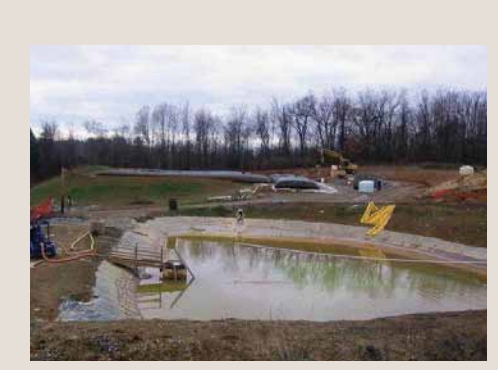
AMD sediment pond

The treatment process of an AMD waste with TenCate Geotube<sup>®</sup> dewatering technology is accomplished through the containment and dewatering of the precipitated solids. The dewatered solids can then be safely and economically disposed in an approved landfill site thus eliminating an environmental problem.