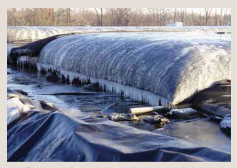
Dewatering under winter conditions