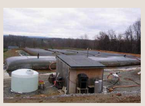
Geotube® dewatering cell